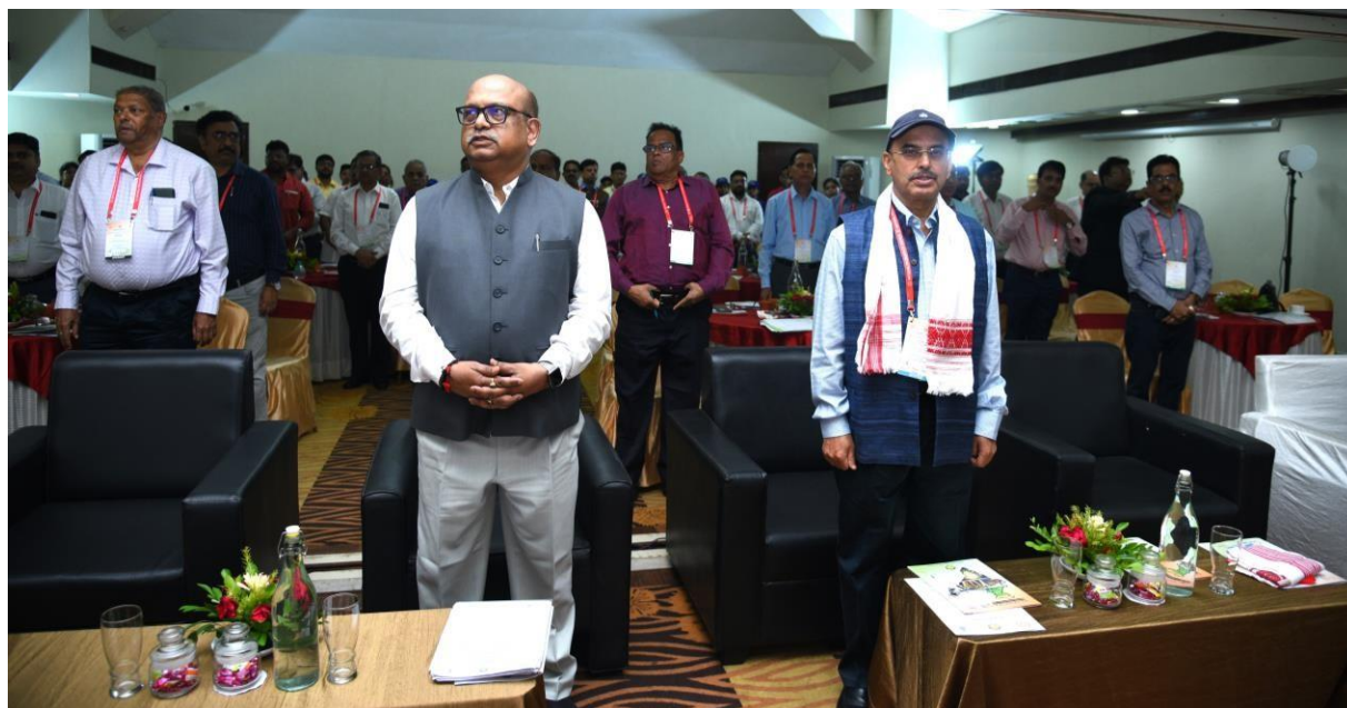
Participants Taking the Pledge of Lifestyle for the Environment

Environment day Pledge- On World Environment Day, participants were encouraged to take the Pledge of Lifestyle for the Environment, with the pledge video to be uploaded on merilife.org. This event aimed to prioritize sustainable lifestyle choices and inspire individuals to contribute to environmental preservation.