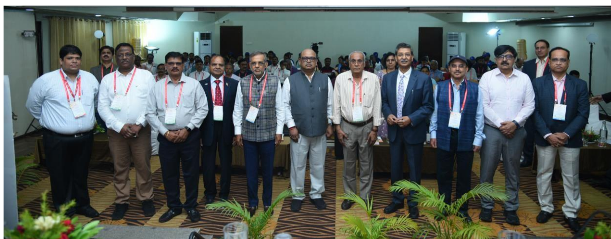
Guest & Invitees with Participant

He also acknowledged The Asian Productivity Organization and Indian Phosphate Limited as supporting partners. Representatives from local productivity councils, government, industries, academia, and interns are thanked for their participation. Appreciation is also expressed to the media and the NPC Bhubaneswar Project Team for their efforts.