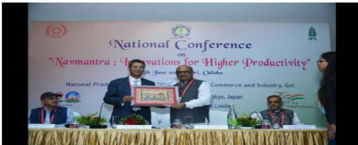
Navmantra: Innovations For Higher Productivity