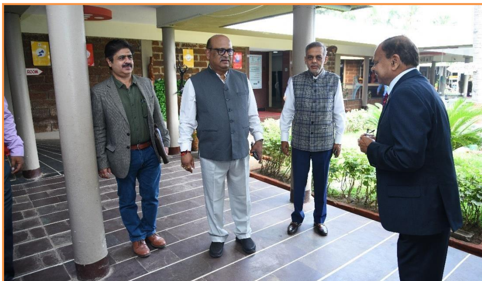
REGISTRATION & WELCOMING GUESTS